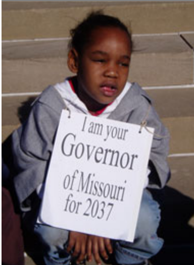
A young child sits on the steps of the Capitol during the Child Advocacy Day Rally.

About Agenda Sponsorships Award Recipients Exhibits Downloads FAQs